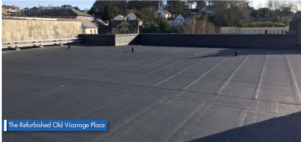
The Refurbished Old Vicarage Place

The roof at Old Vicarage place covers an existing car park which is currently out of service. The existing roof, at the end its service life was showing signs of fatigue and internally there were various leaks as rainwater had found various pathways into the building.