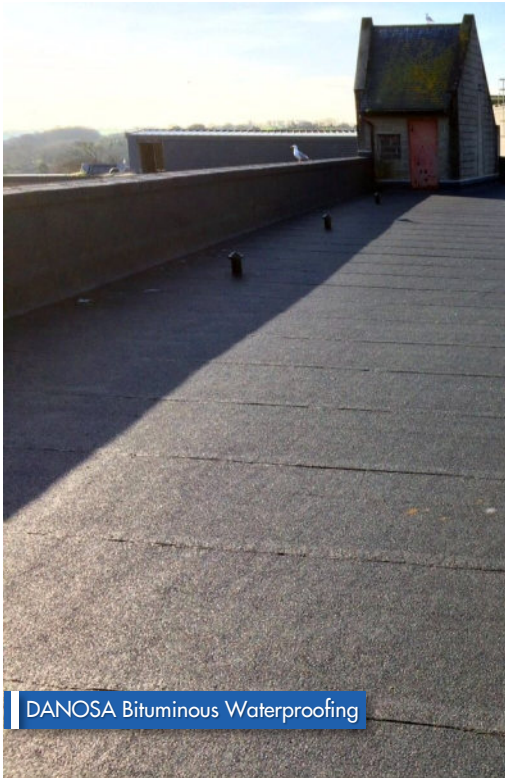
DANOSA Bituminous Waterproofing