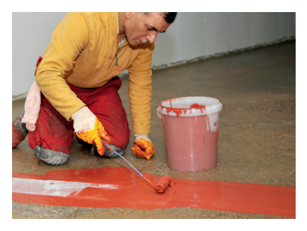
This involves applying an initial layer of PMMA resin, embedding the strips of fleece and removing any air bubbles, then saturating the fleece with the same resin