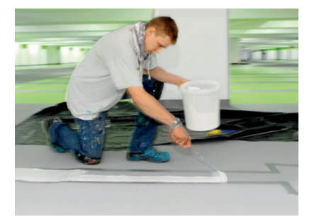
... the arrows, with white Wecryl Finish 288