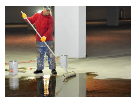
Wecryl Primer 276 is applied to the shotblasted concrete surface

account of its proximity to the palace, but also because it provided direct access to the national garden show - BUGA 2011 – and because it is conveniently located for the city centre. Consequently one of the key criteria when it came to selecting the materials and contractors was sustainability. Contemporary, energysaving LED lighting is installed here, as is a modern and highly durable PMMA Surfacing System that also acts as waterproofing.