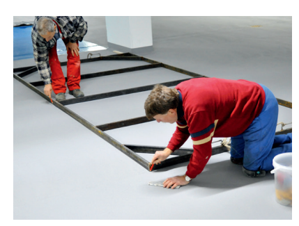
The bays are measured out and masking tape is applied exactly in line with the layout