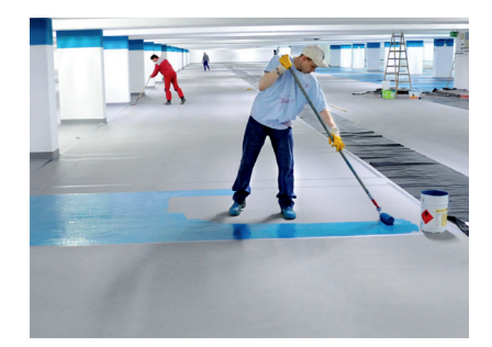
The parking bays are sealed with low-maintenance Wecryl Finish 288 in shades of green and blue