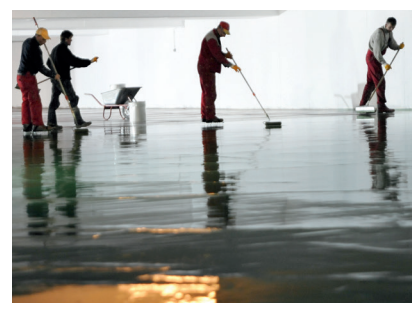
Weproof Fix RR 359 in green, a waterproofing product for main areas, is applied using notched trowels and spiked rollers