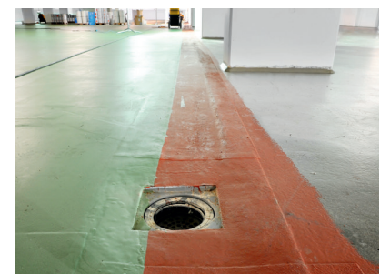
Details on gullies and floor drains are waterproofed wet in wet with Weproof Flex RR 354 and strips of WestWood Fleece