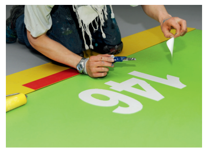
Stencils are used for the car park numbers as well as...