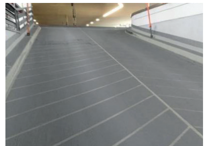
Wecryl 410 Textured Surfacing is abrasion-resistant. It also protects the construction against chloride ingress and creates a safe surface for pedestrians and vehicles