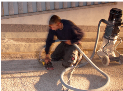
The concrete surface is mechanically prepared. Tracks, 60 cm wide and 5 mm deep, are cut into the concrete

Thanks to the fast-curing waterproofing system, which is based on flexibilised PMMA resins, the refurbishment - including installation of the road surface heating system - could be carried out overnight. This involved cutting out 5 mm deep tracks to receive the road heating elements so that they could be embedded in the levelling compound. By the following morning the ramp could be reopened to traffic.