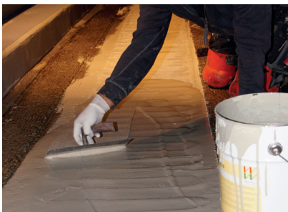
Wecryl 242 Mortar is used to cover the road heating elements and to make good any damage to the surface