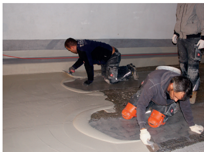
Wecryl 233 Self-Levelling Mortar is applied to provide an even surface