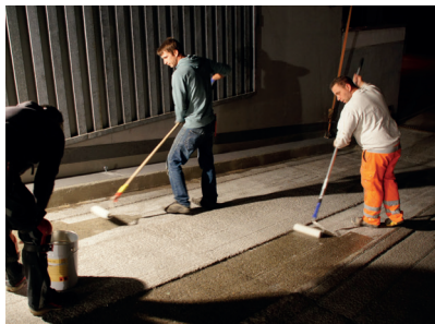
Once the substrate is prepared, the surface is primed with Wecryl 276