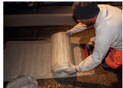
The Etherma/Systec heating mats are embedded directly in Wecryl 810 Surfacers