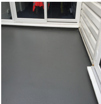
Finished non-slip waterproofing self terminated along areas with limited threshold heights