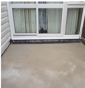
Quartz Sand broadcast into the Wecryl 233 Wearing Layer