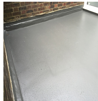
Finished non-slip Waterproofing System