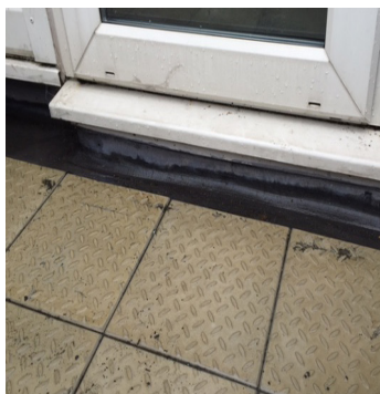
Balconies covered in promenade tiles with limited threshold heights